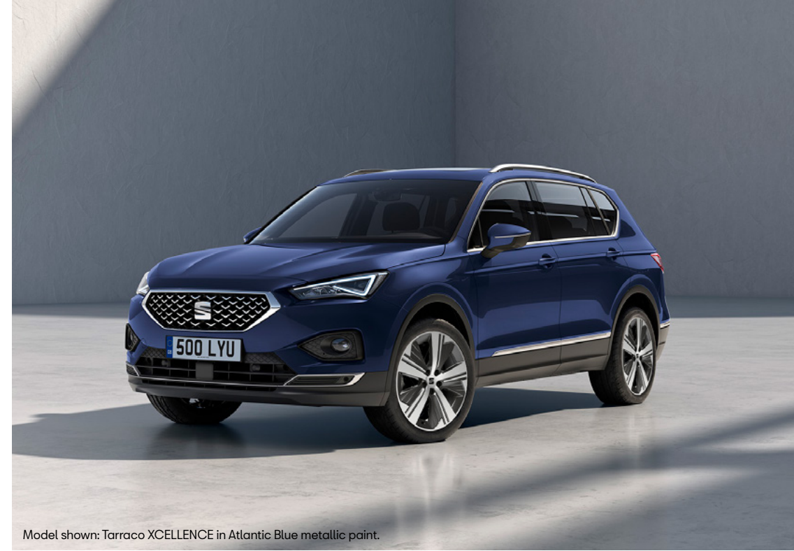
Model shown: Tarraco XCELLENCE in Atlantic Blue metallic paint.

02. Baza Grey cloth with brown Alcantara.