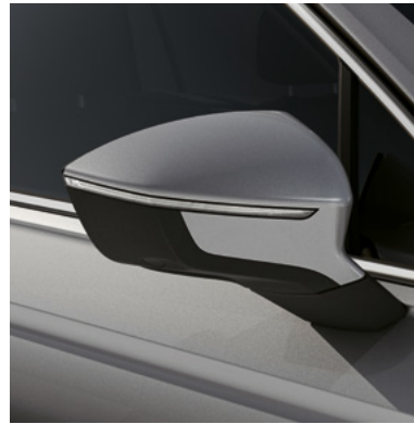
Reflex Silver 2