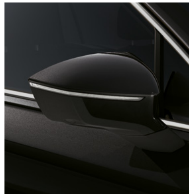
Deep Black 2