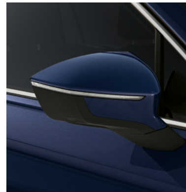
Atlantic Blue 2