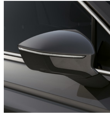
Urano Grey 1