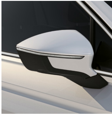
Oryx White 2

Print and screen view do not provide an exact representation of colour. Please refer to the paint colour moulds at your local SEAT Retailer.