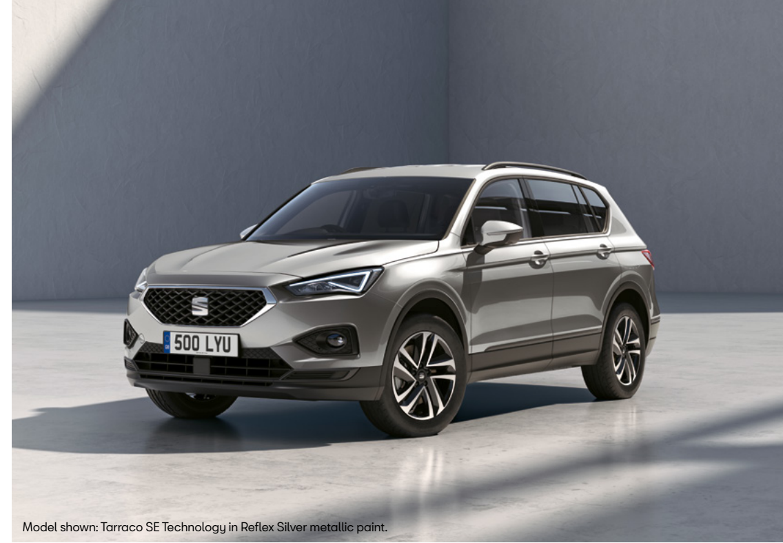
Model shown: Tarraco SE Technology in Reflex Silver metallic paint.