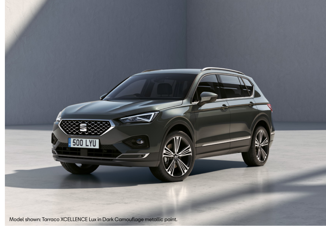
Model shown: Tarraco XCELLENCE Lux in Dark Camouflage metallic paint.