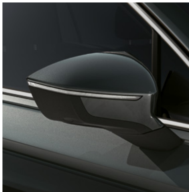
Dark Camouflage 2