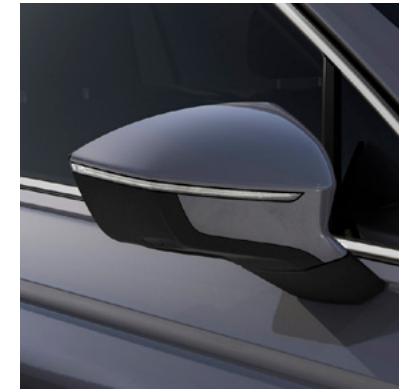
Dolphin Grey 2