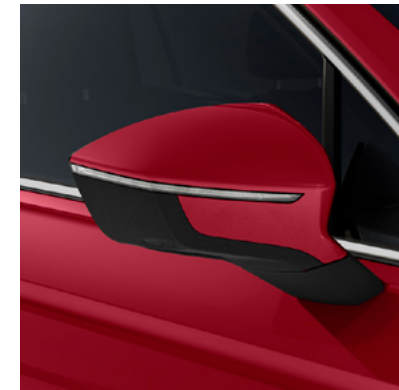
Merlot Red 2