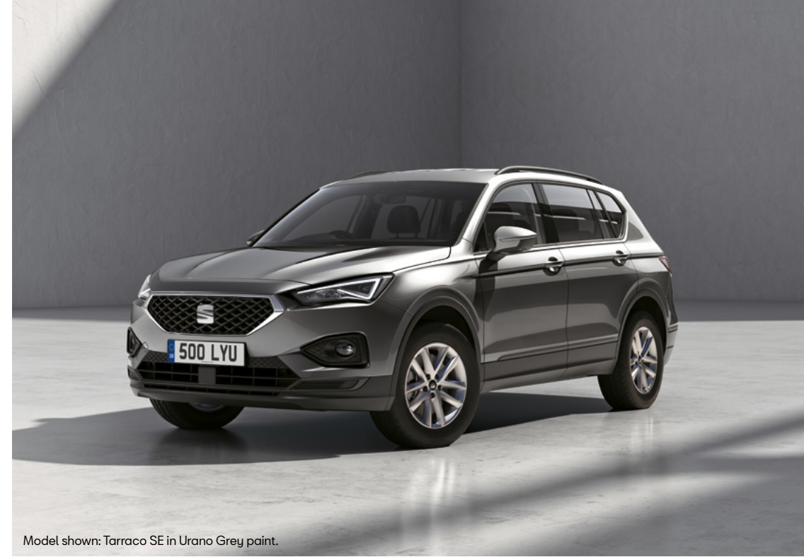
Model shown: Tarraco SE in Urano Grey paint.