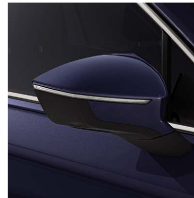
Atlantic Blue 2