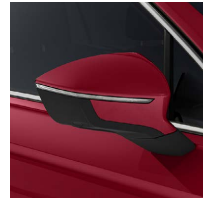
Merlot Red 2