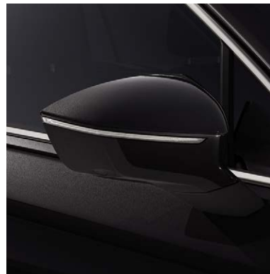
Deep Black 2