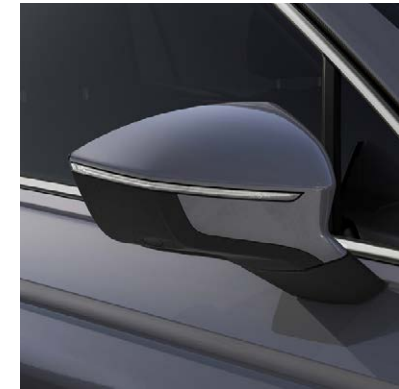
Dolphin Grey 2