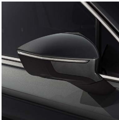
Dark Camouflage 2