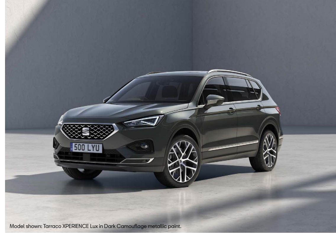
Model shown: Tarraco XPERIENCE Lux in Dark Camouflage metallic paint.