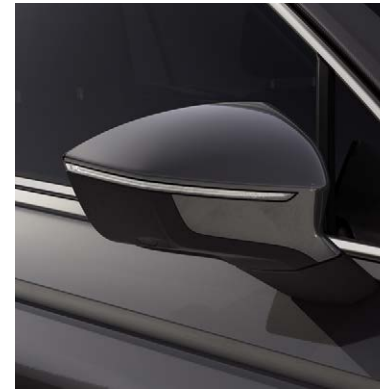
Urano Grey 1