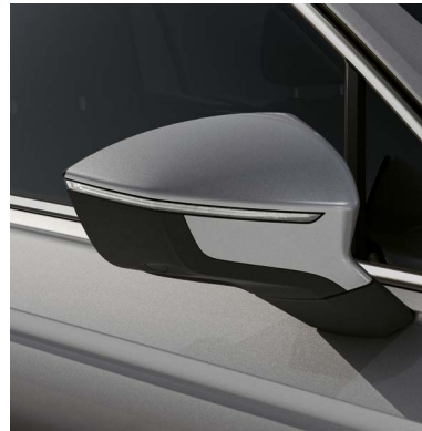
Reflex Silver 2