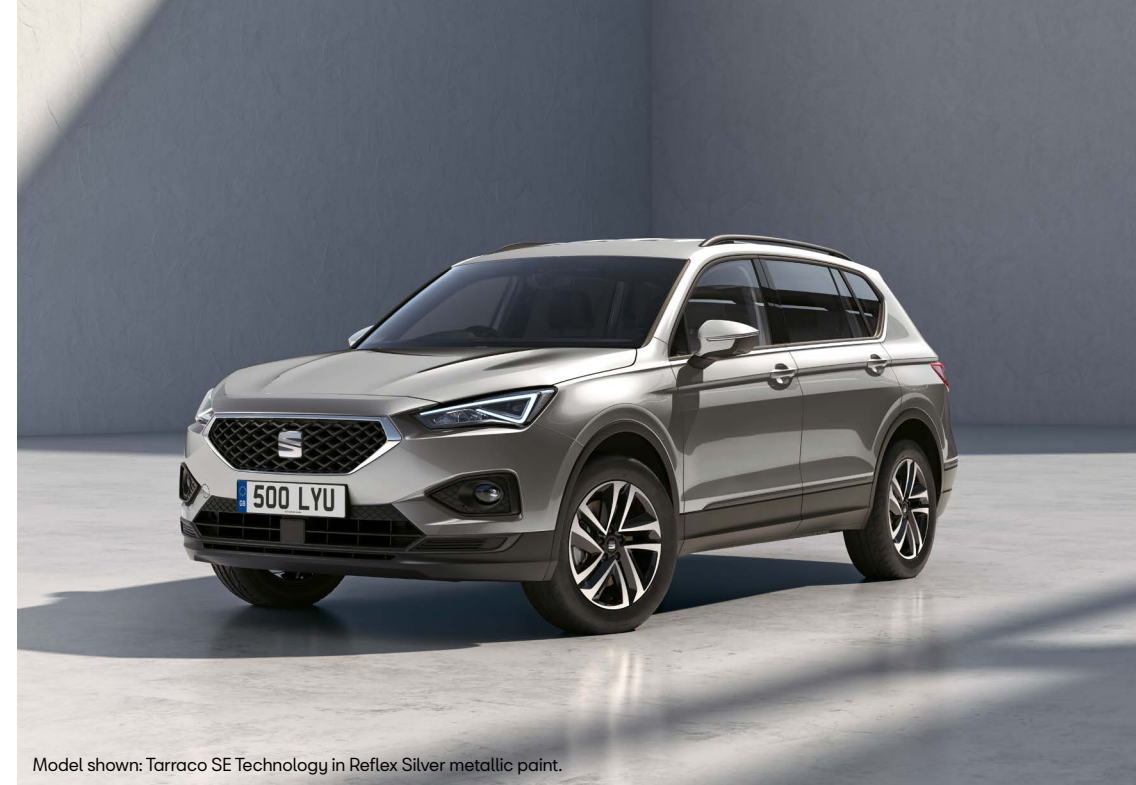
Model shown: Tarraco SE Technology in Reflex Silver metallic paint.