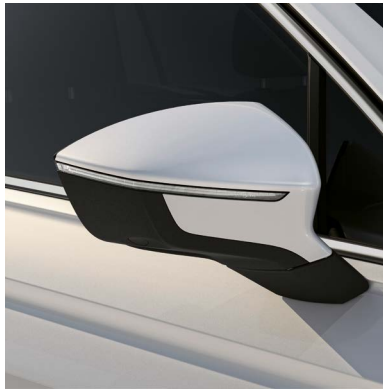
Oryx White 2

Print and screen view do not provide an exact representation of colour. Please refer to the paint colour moulds at your local SEAT Retailer.