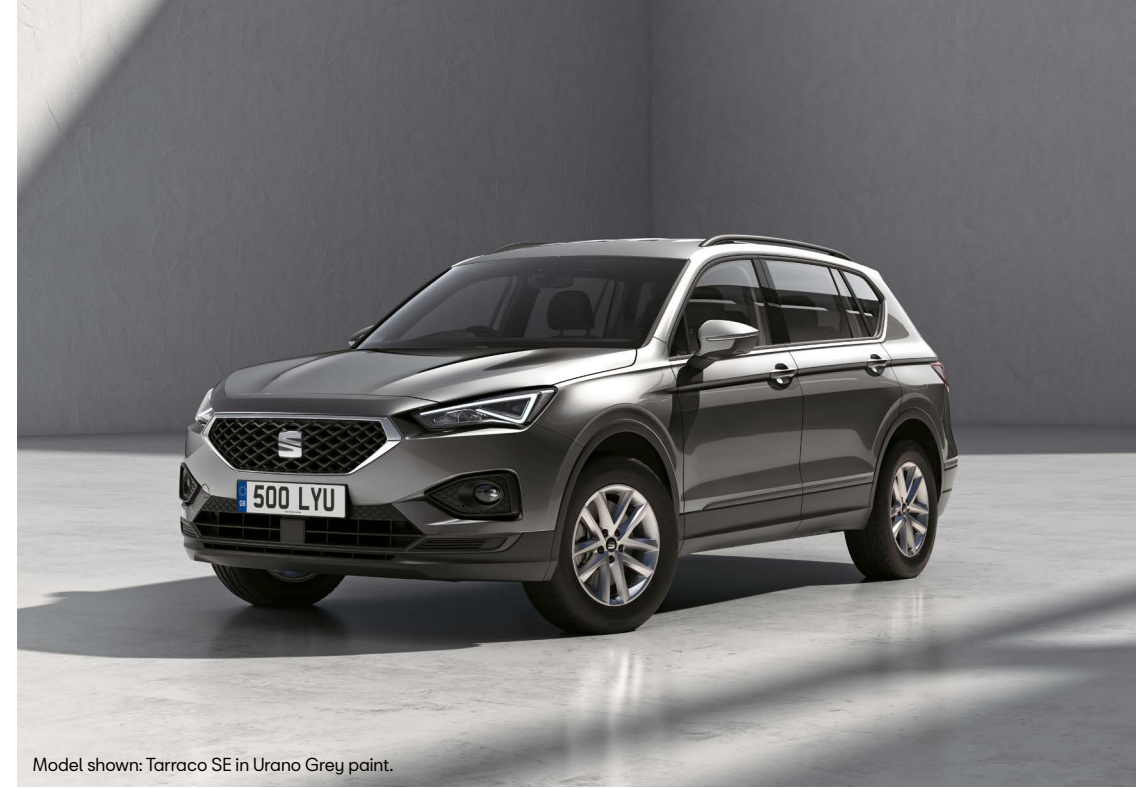
Model shown: Tarraco SE in Urano Grey paint.