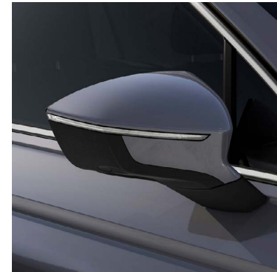
Dolphin Grey 2