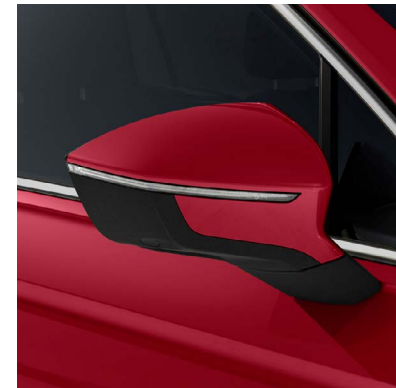
Merlot Red 2