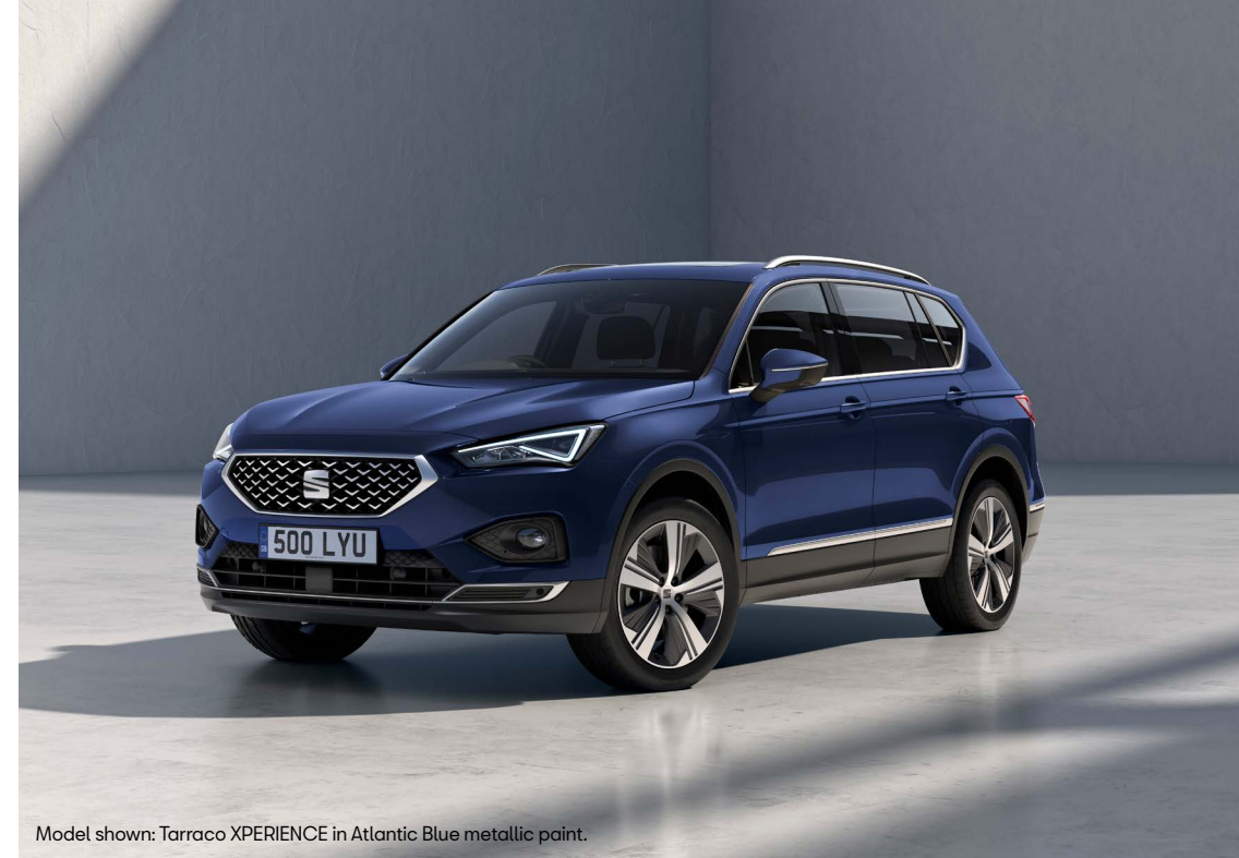
Model shown: Tarraco XPERIENCE in Atlantic Blue metallic paint.

02. Black cloth in Dinamica with silver stitching.