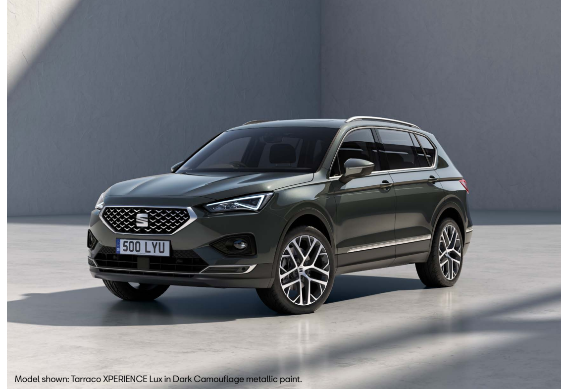
Model shown: Tarraco XPERIENCE Lux in Dark Camouflage metallic paint.