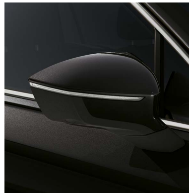
Deep Black 2