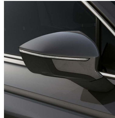
Urano Grey 1