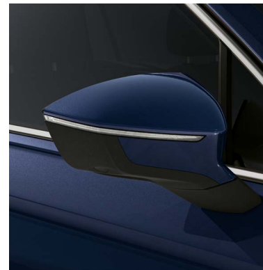
Atlantic Blue 2