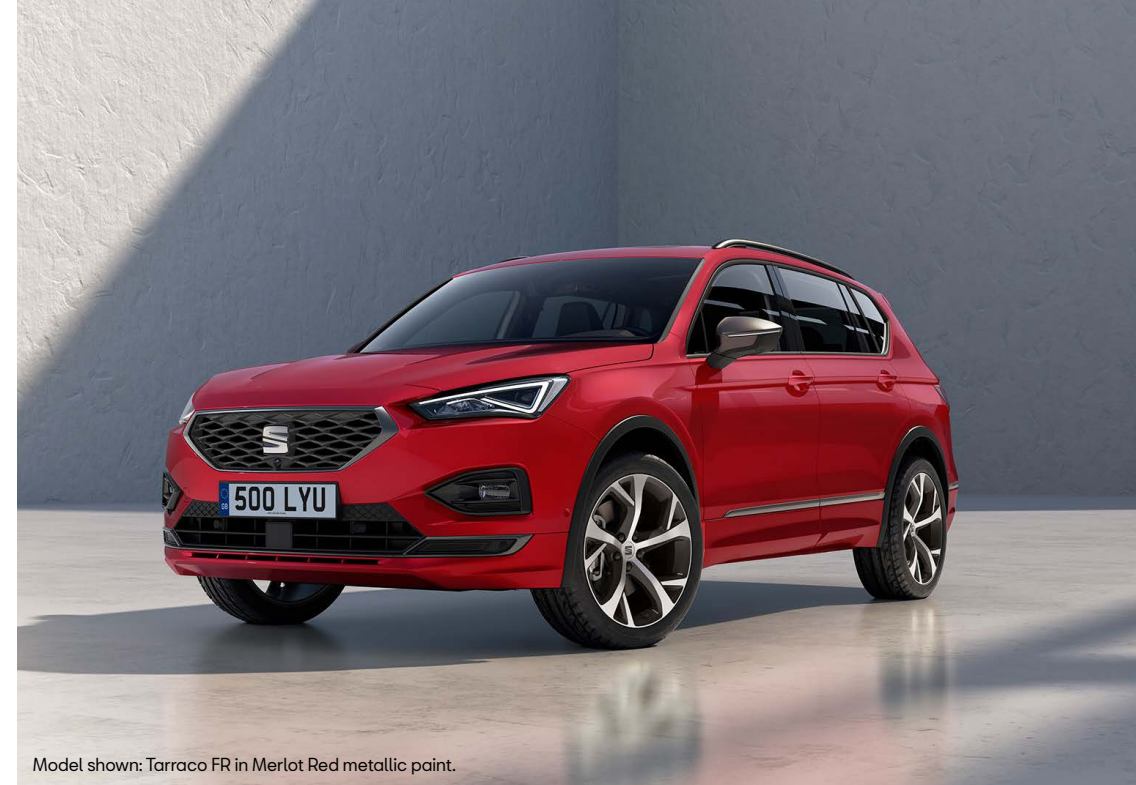
Model shown: Tarraco FR in Merlot Red metallic paint.

*Price is for Tarraco FR 1.5 EcoTSI 150PS.