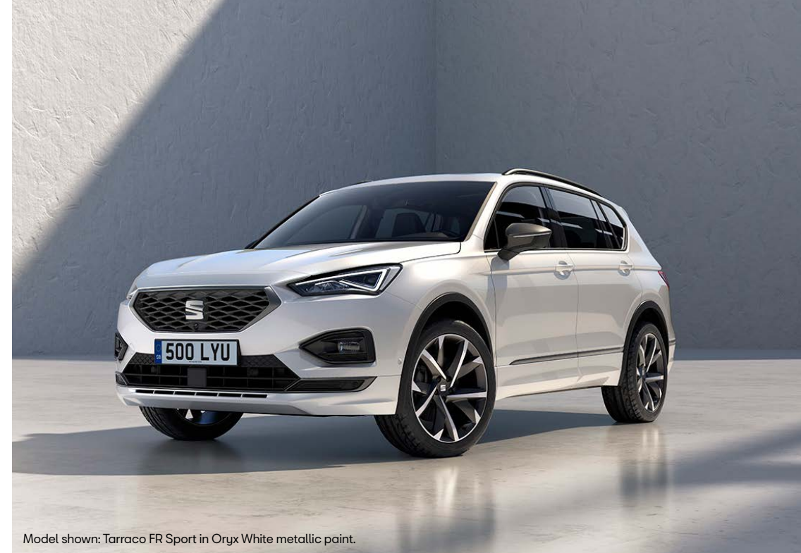
Model shown: Tarraco FR Sport in Oryx White metallic paint.