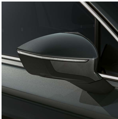
Dark Camouflage 2