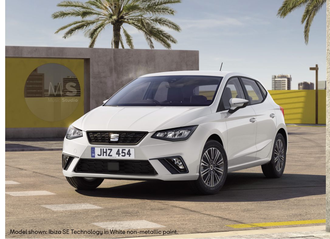
Model shown: Ibiza SE Technology in White non-metallic paint.

6 The SEAT Ibiza. Pricing and specification list.