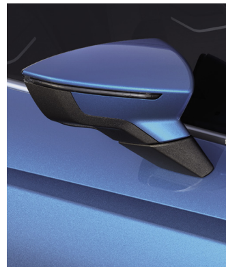
Sapphire Blue 2