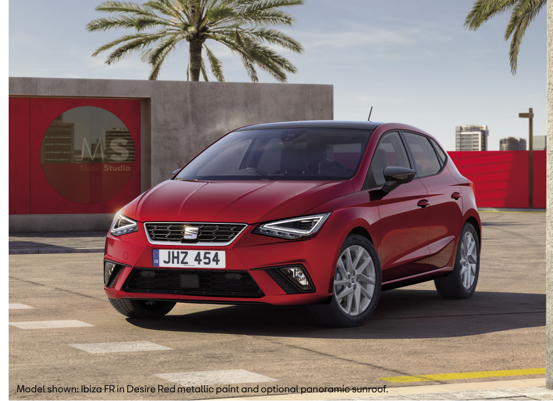
Model shown: Ibiza FR in Desire Red metallic paint and optional panoramic sunroof.