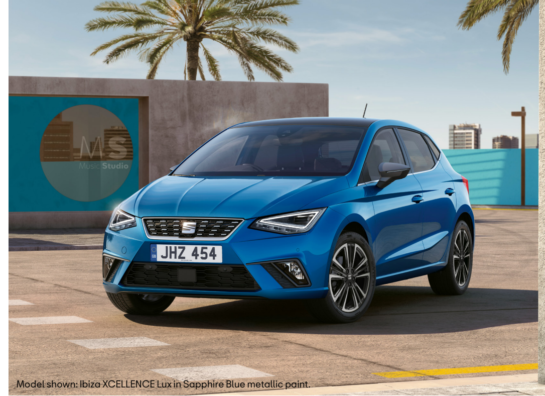
Model shown: Ibiza XCELLENCE Lux in Sapphire Blue metallic paint.

*Price is for Ibiza XCELLENCE Lux 1.0 TSI 95PS.