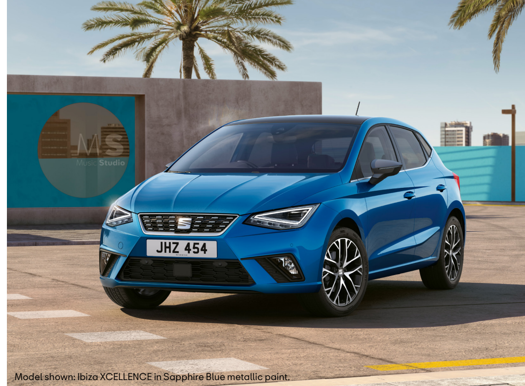
Model shown: Ibiza XCELLENCE in Sapphire Blue metallic paint.

*Price is for Ibiza XCELLENCE 1.0 TSI 95PS.