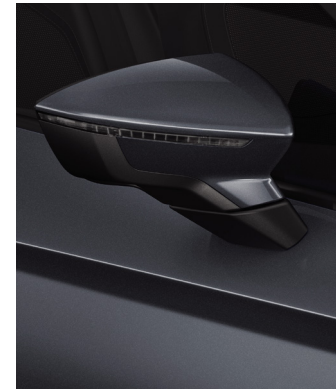
Magnetic Tech Grey 2