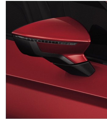
Desire Red 2