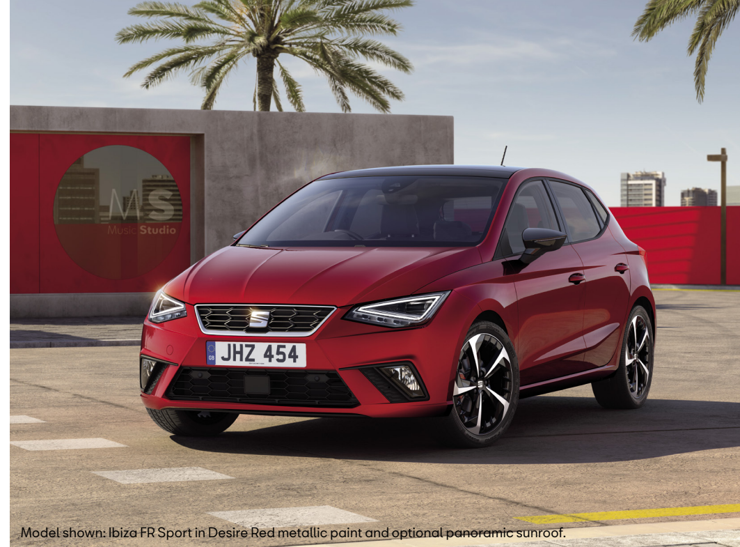
Model shown: Ibiza FR Sport in Desire Red metallic paint and optional panoramic sunroof.