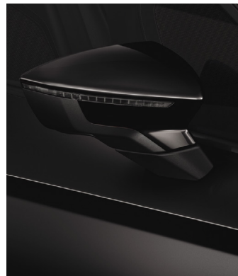
Midnight Black 2