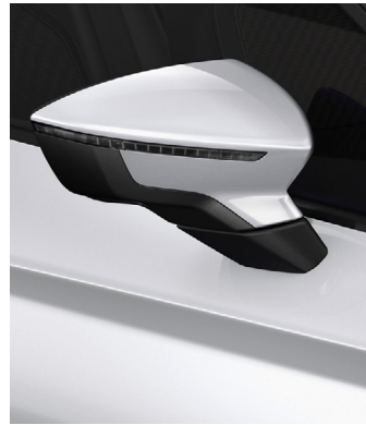
Nevada White 2