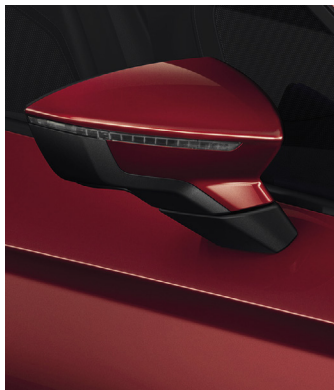
Emocion Red 1