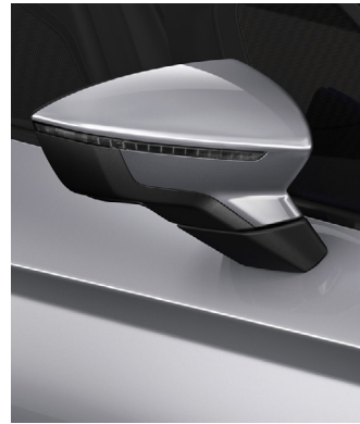
Urban Silver 2